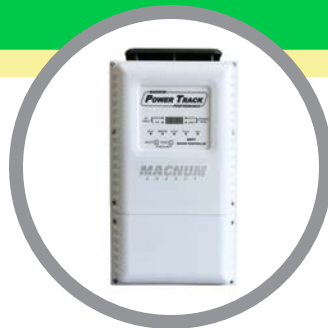
Up to seven (7) PT-100 Charge Controllers for 42kW output at 48V