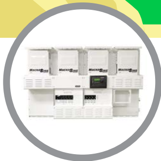
Magnum Energy MPDH Panel and four MS-PAE Inverter/Chargers