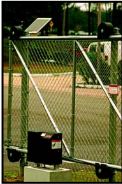
Gate Operator